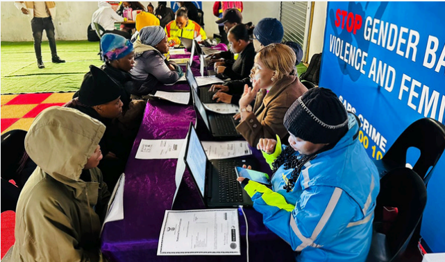
Pictured: DDP Partner, Inanda Youth Crime Prevention Desk volunteers during a campaign at Inanda

DDP also partners with community-based organizations such as EmpowerU Community Development Institute in Lindelani and the Centre for Community Development in Umlazi. These partnerships focus on civic education, leadership development, and strengthening the role of civil society in local governance.