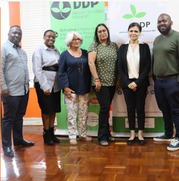
Pictured: DDP team with CF team during a site visit in Durban.