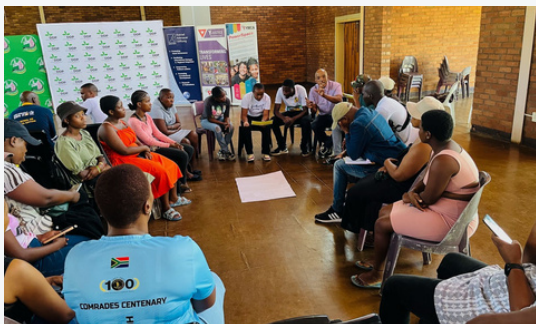
Pictured: Delegates at DDP Local Government Dialogue in PMB, in partnership with Msunduzi Local Municipality.

DDP also convened a series of Public Forums, including the Post-State of the Nation Address (SONA) Forum and the International Women's Day Forum , which brought together government officials, academics, civil society leaders, and activists to reflect on national policy, gender equity, and governance transparency.