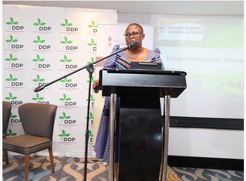
Pictured: Hon. Nontembeko Boyce, Speaker of the KNZ Provincial Parliament at the DDP International Women's Day Forum.

These summits focused on the role of tertiary institutions in promoting civic education, youth political participation, and policy dialogue.