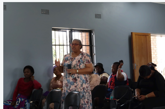
Pictured: Delegates at the LGALN workshop at Eshowe.

Through targeted training and mentorship, participants have developed the capacity to advocate for their communities, address local issues, and influence policy decisions that affect their lives.