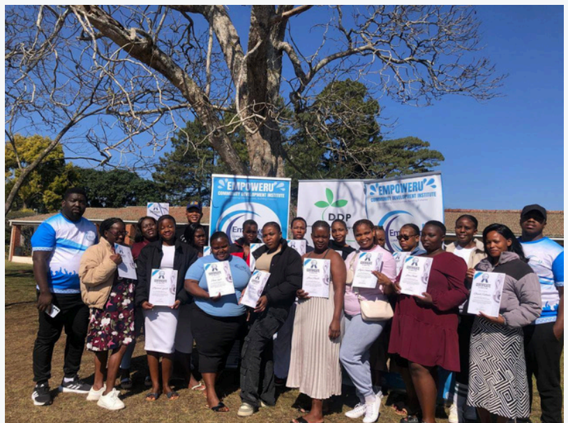
Pictured: Interventions by EmpowerU organisation in partnership with DDP.

DDP's inclusive and participatory approach to community engagement has significantly enhanced our ability to build trust and foster meaningful relationships within the Lindelani community.