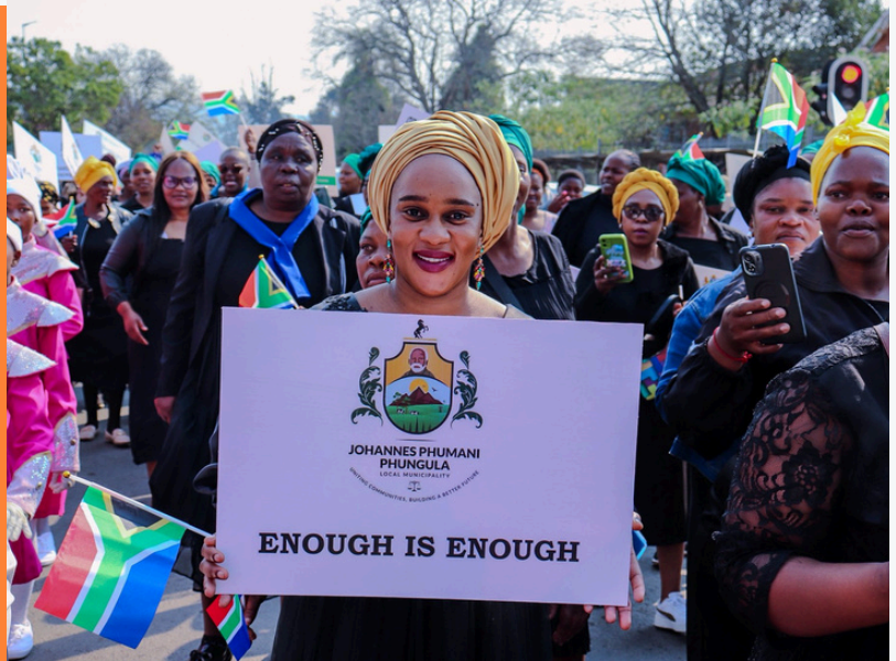
Pictured: Women's March at JPP Municipality in partnership with DDP.

DDP has played a pivotal role in strengthening democratic governance and civic engagement across various municipalities in KwaZulu-Natal (KZN), including uMkhanyakude District Municipality, uMsunduzi Local Municipality, Johannes Phumani Phungula Local Municipality (formerly Ubuhlebezwe), uThukela District, Umngeni Local Municipality, Impendle Local Municipality, eThekweni Municipality, and Mkhambathini Local Municipality.