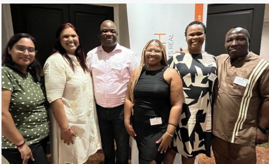
Pictured: BlackSash KZN team and the DDP Team at the LGALN workshop.

Moreover, these initiatives have highlighted the importance of inclusivity, ensuring that diverse perspectives are represented in democratic conversations.