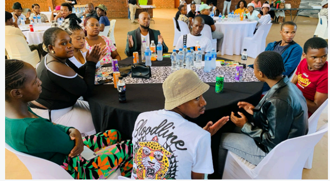
Pictured: Delegates at the DDP Youth Indaba in partnership with MUFG and UMngeni Municipality

Through a series of targeted initiatives, DDP created inclusive platforms for dialogue, education, and advocacy in local municipalities and institutions of higher learning, with a particular focus during Women's Month and Youth Month.