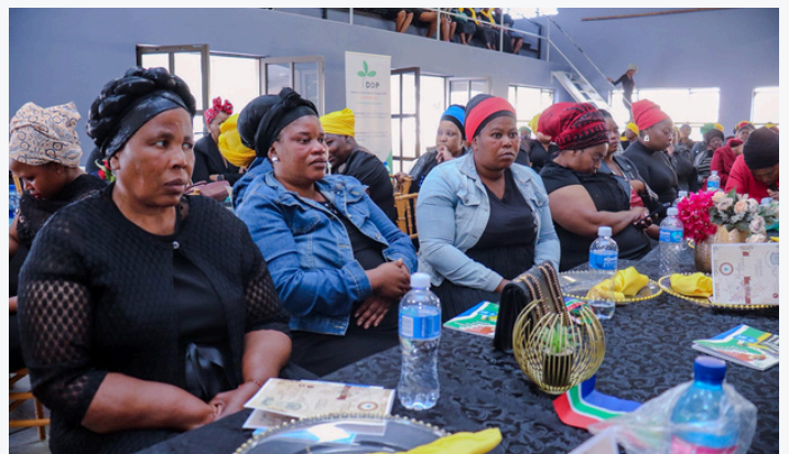
Pictured: Delegates at the Women's Conference in partnership with JPP Local Municipality in Ixopo.

In Inanda, DDP partnered with the Youth Crime Prevention Desk to host a Women's Seminar focused on combating gender-based violence. Held at the O.R. Tambo Community Center, this seminar provided a safe space for women to share their experiences and advocate for safer, more inclusive communities.