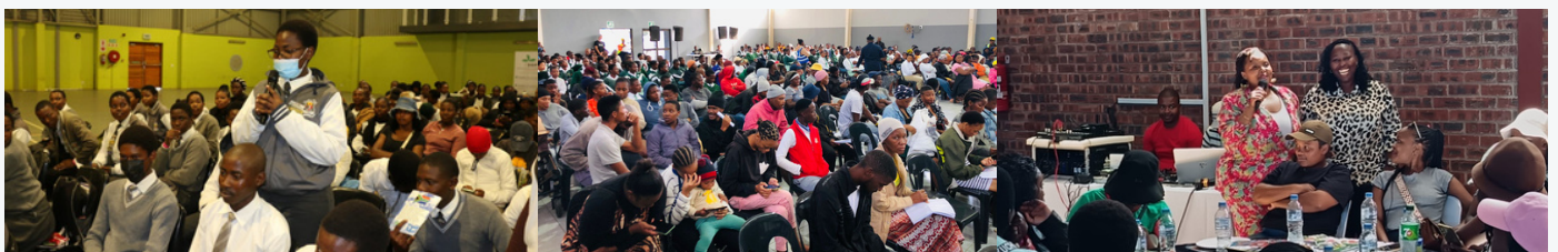
Pictured: Delegates at the Youth Indaba conferences hosted in partnership with local Municipality in KZN.

This summit brought together students, educators, and civic leaders to discuss innovative strategies for engaging young people in governance and policy-making.