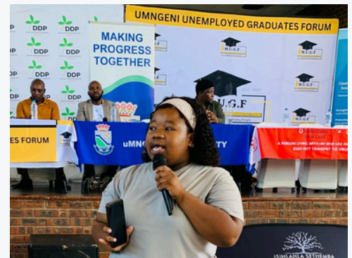
Pictured: Youth Indaba in partnership with Umngeni Local Municipality and the MUGF.