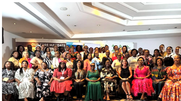
ABOVE: The DDP team with members of the KZN Legislature

FOLLOW US ON OUR SOCIAL MEDIA PAGES @DDPDEMOCRACY OR @DDP_DEMOCRACY