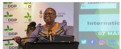
ABOVE: Hon Nontobeko Nothemba Boyce, Speaker of the KZN Legislature