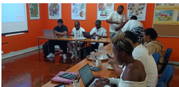
ABOVE: Delegates at the SJI Inception Workshop, held at the DDP office

The inception workshop for the second phase of the Social Justice Initiative project by DDP was a key event in promoting human rights and civic engagement. The Executive Director welcomed delegates and partners, introducing the project concept and discussing implementation strategies, risks, and opportunities. The project uses a multi-method approach, including mapping research, community dialogues, capacity-building workshops, and radio talk shows to educate the public.