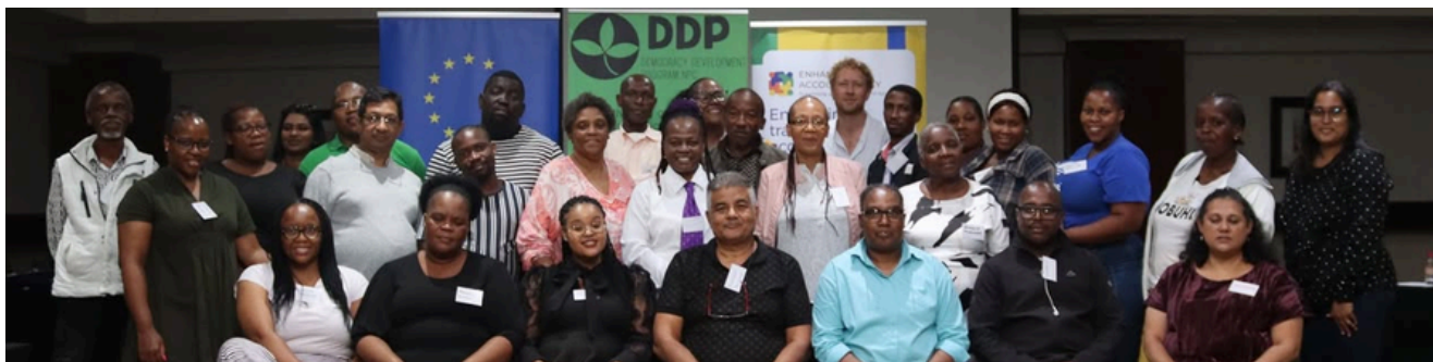
ABOVE: DDP facilitators and delegates at the anti-corruption workshop in Durban

On 11-13 March, in partnership with the Enhancing Transparency and Accountability programme and co-funded by the European Union, DDP held anti-corruption workshops in Richards Bay and Durban. These sessions brought together civil society leaders, traditional leaders, councillors, and community representatives to explore corruption beyond financial misconduct—highlighting issues like sextortion and gender power dynamics.